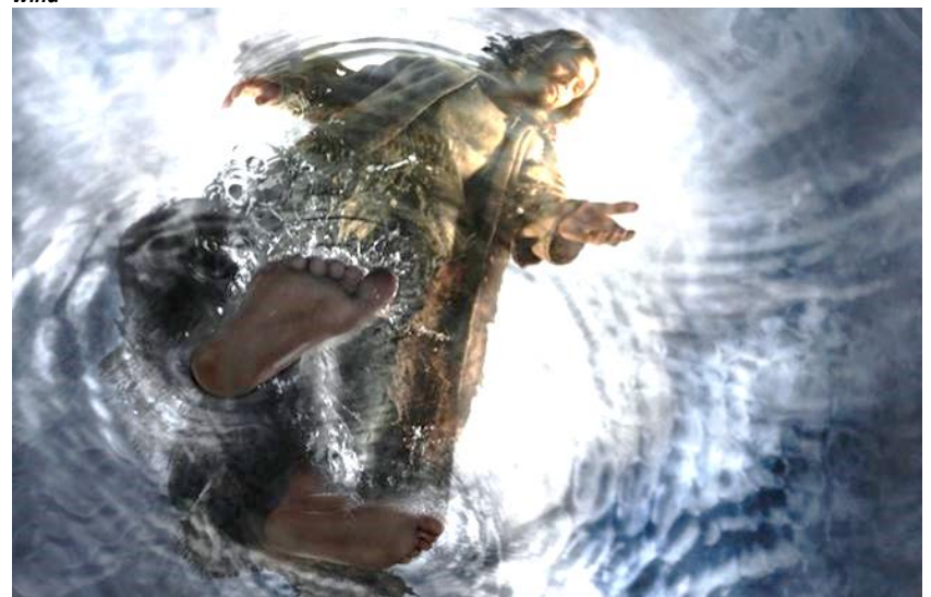
John 20:30-31 (ESV) The Purpose of This Book

Footnotes: a. <u>Matthew 14:24</u> Greek many stadia , a stadion was about 607 feet or 185 meters b. <u>Matthew 14:24</u> Some manuscripts was out on the sea c. <u>Matthew 14:30</u> Some manuscripts strong wind