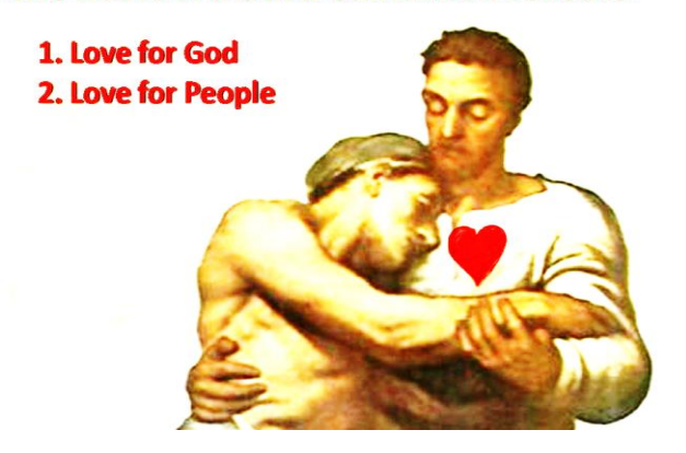
Proverbs 14:31 (ESV)

31 Whoever oppresses a poor man insults his Maker, but he who is generous to the needy honors Him.