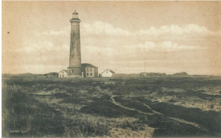
Lighthouse, Skagen, Denmark