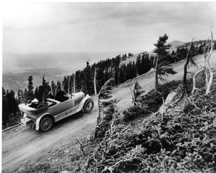
Driving on the road up on Pikes Peak, Colorado