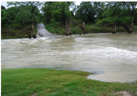
Flash flood, Palmetto State Park, Texas