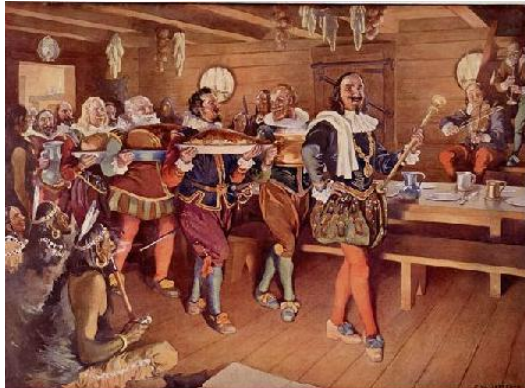
“The Order of Good Cheer, 1606” By Charles William Jefferys (1869-1951) Public domain in Canada

http://www.thecanadianencyclopedia.ca/en/article/thanksgiving-day/