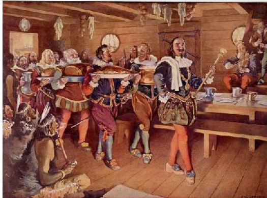
“The Order of Good Cheer, 1606”

http://www.thecanadianencyclopedia.ca/en/article/thanksgiving-day/