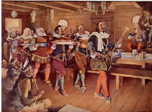
“The Order of Good Cheer, 1606” By Charles William Jefferys (1869-1951)

http://www.thecanadianencyclopedia.ca/en/article/thanksgiving-day/